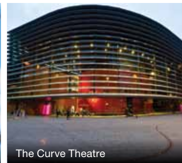
The Curve Theatre