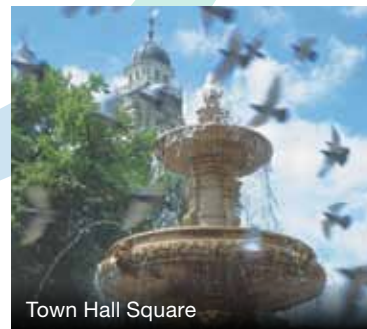
Town Hall Square