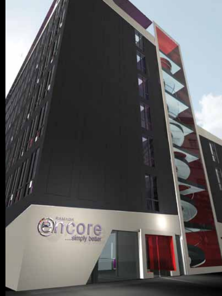
Leicester City Centre