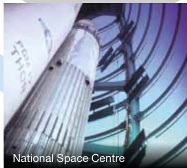
National Space Centre